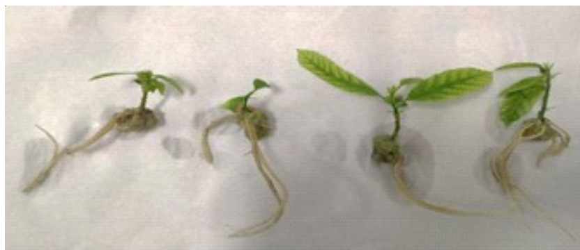
Figure 4: Root formation in plants on 21 days after their cultivation in a DKW nutrient medium, to which the hormones IBA, IAA and NAA were added at the rate of 1 mg IBA, 0.5 mg IAA and 0.5 mg NAA/1 L DKW

Figure 4 concerns 21 days of root in the DKW nutrient medium, to which the hormones IBA, IAA and NAA were added at the rate of 1 mg IBA, 0.5 mg IAA and 0.5 mg NAA/1 L DKW; under these conditions, good rooting occurred by the end of 21 days.