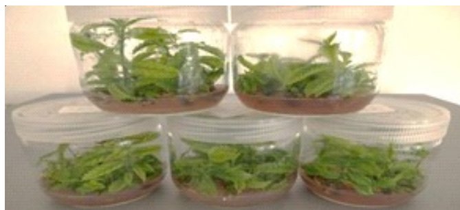
Figure 3: Appearance of 21-day-old plants in the variant with the planting of the first sprouts in the DKW nutrient medium, to which the hormones BAP, IBA and GA3 and iron chelate were added at the rate of 1 mg BAP, 0.1 mg IBA, 0.35 mg GA3 and 0.2 mg iron chelate /1 L DKW.

Figure 2 concerns the 14 th day of the formation of green tissues when growing the meristem of the axillary buds of Azerbaijani chestnut in a DKW nutrient medium, to which the hormones BAP, IBA and GA3 and iron chelate were added at the rate of 0.6 mg BAP, 0.01 mg IBA, 0.1 mg GA3 and 0.168 mg iron chelate/1 L DKW.