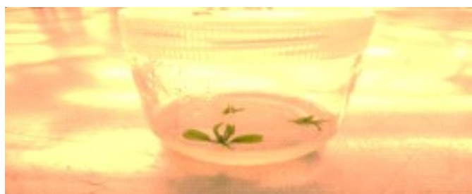
Figure 1: The appearance of the first greenery on the 14 th day of growing the meristem of the axillary buds of the Azerbaijani chestnut in a nutrient medium DKW, to which the hormones BAP, IBA and GA3 were added at the rate of 0.6 mg BAP, 0.01 mg IBA, 0.1 mg GA3 / 1 L DKW

At the stage of germination of the meristem of fruit buds of sterilized explants, along with the DKW nutrient medium, hormones BAP, IBA and GA3 were used in various doses, and many experiments were conducted to